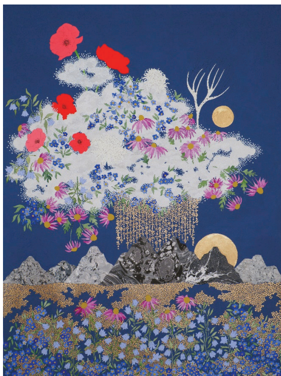
our place, "above the mountains" (2023) Gouache, watercolor, ink and collage on paper, 152.4 x 114.3 cm

After the sudden loss of her father at the beginning of the pandemic, Liu went on many long walks in nature to find comfort. Flowers in particular helped her heal and be more hopeful. The painting series "our place" was developed during this period with the intention to create a dream garden for her and her father to meet again. This garden, full of white chrysanthemums, poppies, forget-me-nots, bluebells, and echinacea is a dreamscape where two moons can co-exist, with endless stars twinkling in the garden, and flowers can flourish up high in the clouds. Flowers are often symbolically associated with femininity and softness, but Liu's flowers represent strength, everlasting love and promises to remember.