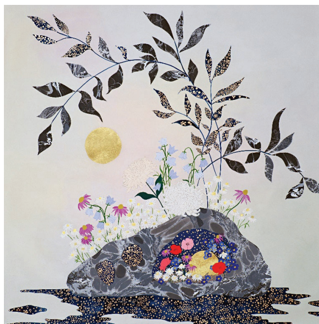
the rock garden, "you gave me everything, I" (2023) Gouache, gold leaf, watercolor, ink and collage on paper, 122 x 122 cm

These magnified portrayals of nature allowed the artist to express intense emotions. Boulders holding up the oceans and skies filled with stars and weeping flowers. Each arrangement is a world unto itself, with lessons of life, love and hopes – creating new worlds and finding new ways to thrive.