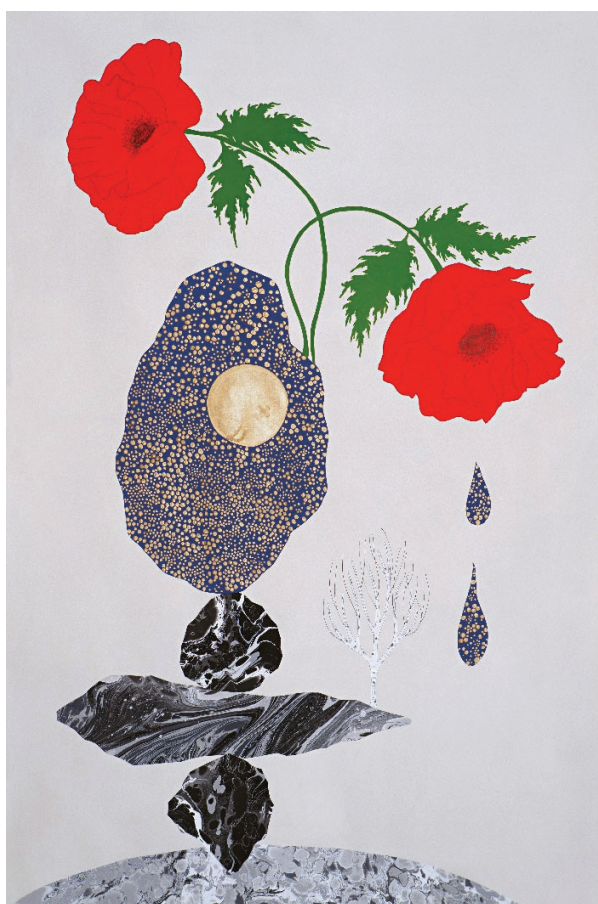
the rock garden, “you are my rock” (2023) Gouache, watercolor, ink and collage on paper, 152.4 x 101.6 cm

The artist will be present, and available for press interviews.